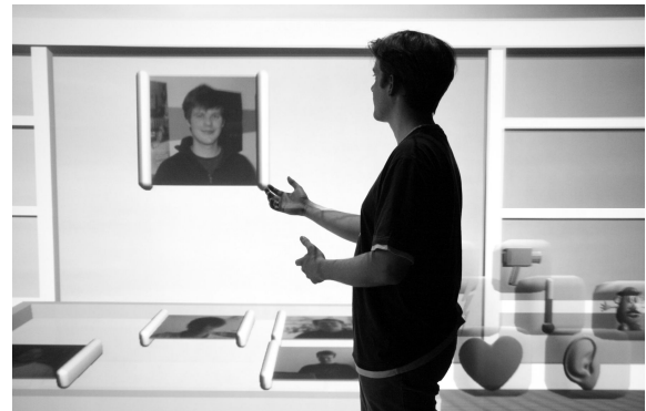
Figure 22 The ISDs in the immersive Virtual Reality set-up. Interlocutors are represented by scroll-like panels floating in the air. The layout of the ISDs can be arranged by the user

Our investigations up to now focused on the question of how the displays are augmented by presenting information, e.g. about the affective state of the interlocutor, at the display, e.g. using audio, video or graphs. However, inspired by the aforementioned findings, here we want to pose a different