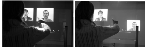
Figure 24: Example interaction with the HoloPro TM prototype: the right ISD is sent to the back with a tap of a finger (perspectively correct for the user's view, however not for the camera taking the picture)

Secondly the user may manually alter the position of individual displays. This approach solves the problem with multi-party conferences that altering the position of the user affects the distances to all displays at once. However, it may be restricted by physical constraints, e.g., there is in principle only a single depth-plane in desktop systems. Thus other ways have to be found to provide at least the impression of depth/distance, and we will enumerate some possibilities later on when we discuss the desktop interface.